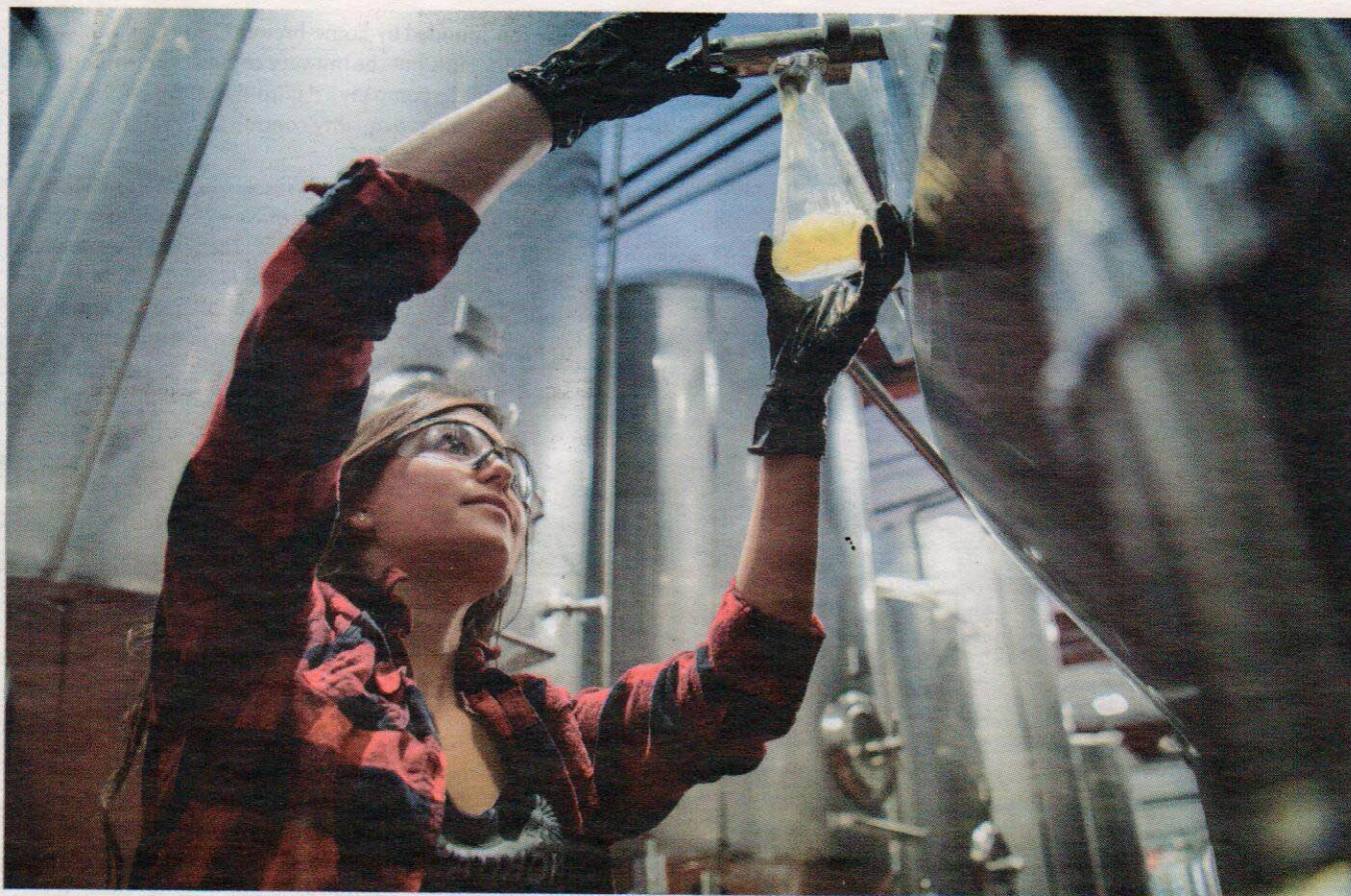
BREW CREW - A gathering of female brewers this spring in Jackson, the All Women's Brew Day on March 8, resulted in the creation of "Moxie" Mango Unfiltered IPA while raising funds for the Jackson Community Safety Network against domestic violence.